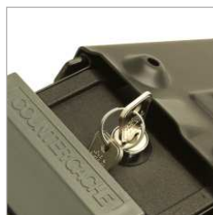
Secure locking system