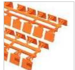
Numbered security seals