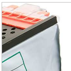
Tamper evident pouch