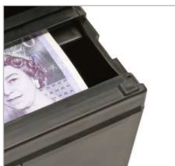
Perfect note presentation

Protecting over a billion dollars every day